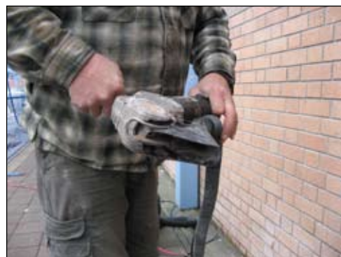
Orbital/oscillating cutting saw with LEV